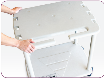
Rolling travel cart

*Travel anywhere within the United States. Restrictions on international and sea travel apply. Ask your home therapy nurse for further details.