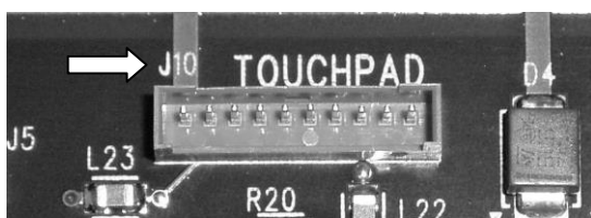
Requires Touchpad Reset Board

Below are pictures showing the different orientation of the Touchpad connector and the different connector designation: